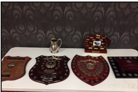
CMC Perpetual Trophies engraved for 2018