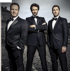
The Celtic Tenors