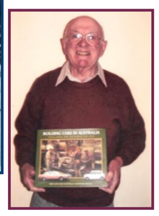
Building Cars in Australia produced by the BMC-Leyland Aust Heritage Group and co--written by Roger.