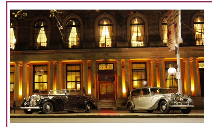
Throughout the Club's history Members have enjoyed a range of social activities themed around the automobile and whilst the interests have widened; travel, touring and collecting automobiles and their memorabilia have remained key areas.

THE ROYAL AUTOMOBILE CLUB OF AUSTRALIA 89 MACQUARIE ST, SYDNEY PHONE: 02 8273 2300