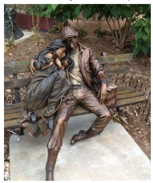
Information not available.