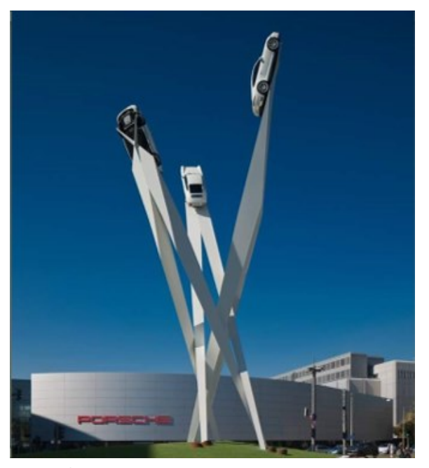
Judah fixed Porsche 911's to steel sculpture.