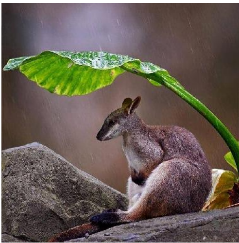
Rock Wallaby shelters from the rain. Proserpine area Queensland.