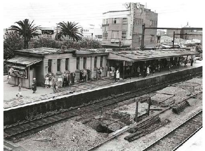
Hurstville Railway Station circa 1950s