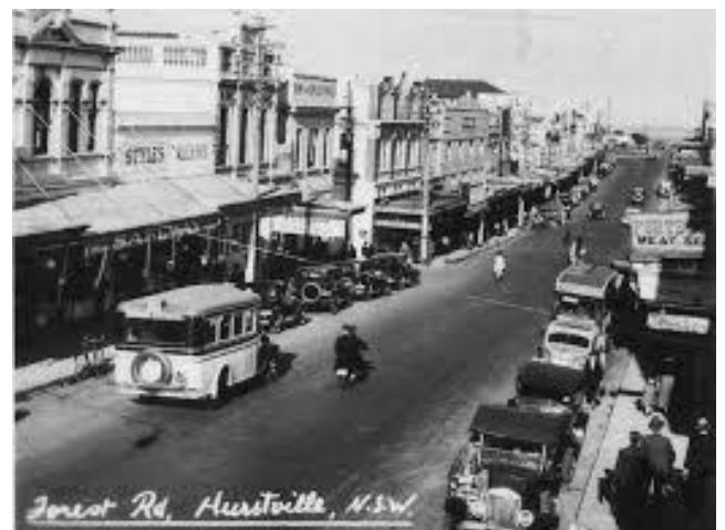
Forest Road Hurstville 1930s??