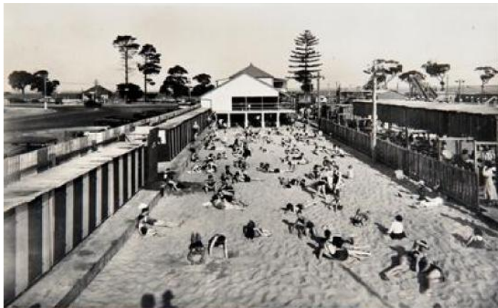
Ramsgate Baths Sunbathing area