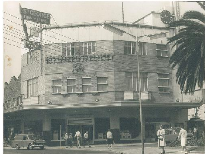
The old St George County Council chambers circa early 1960's ?