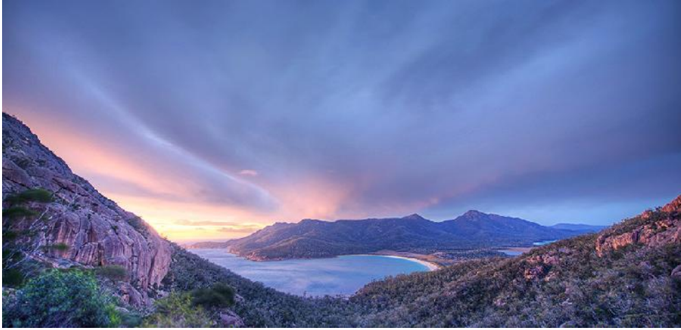
Wineglass Bay, Tasmania