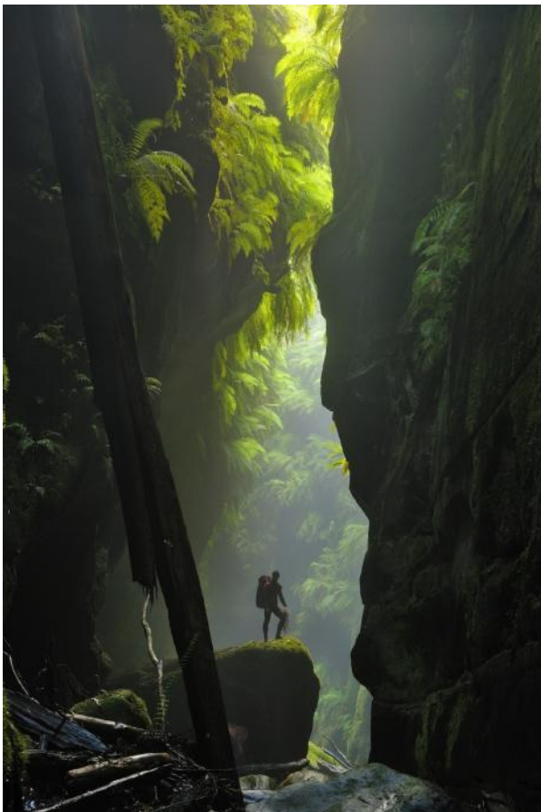
Claustal Canyon in the Blue Mountains