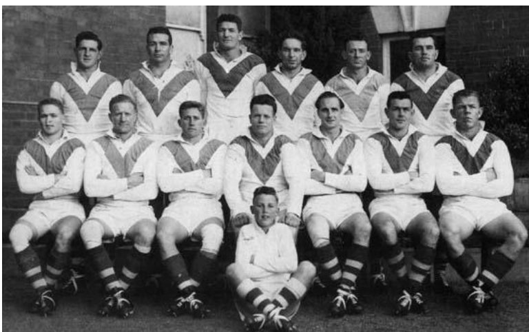
The Mighty Dragons 1956 side...