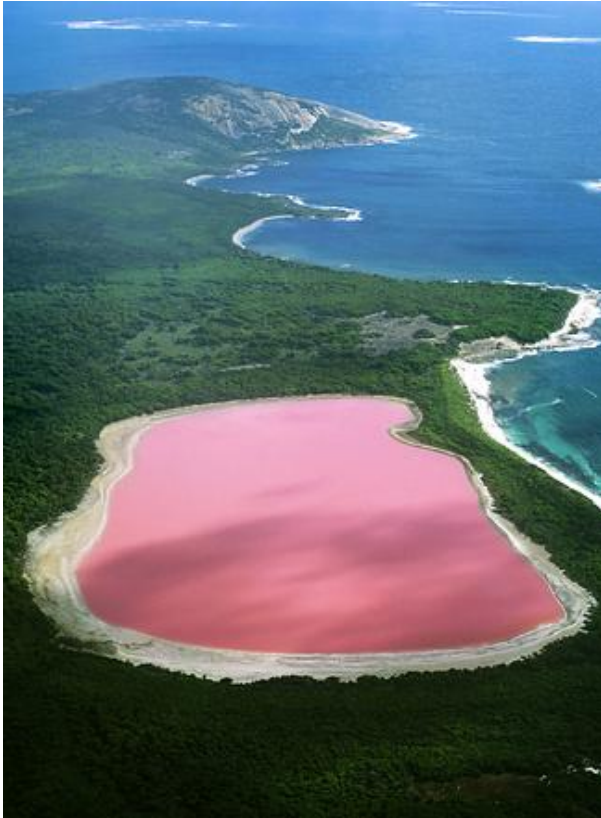
Lake Hillier is a saline lake on the edge of Middle Island, the largest of the islands and islets that make up the Recherche Archipelago in the Goldfields-Esperance region, off the south coast of Western Australia.