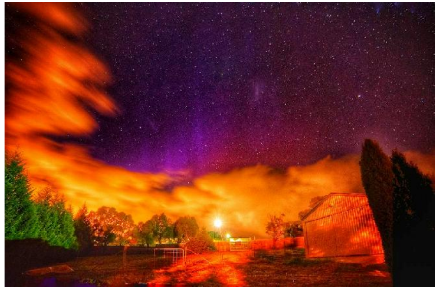
Aurora Australis - Tasmania