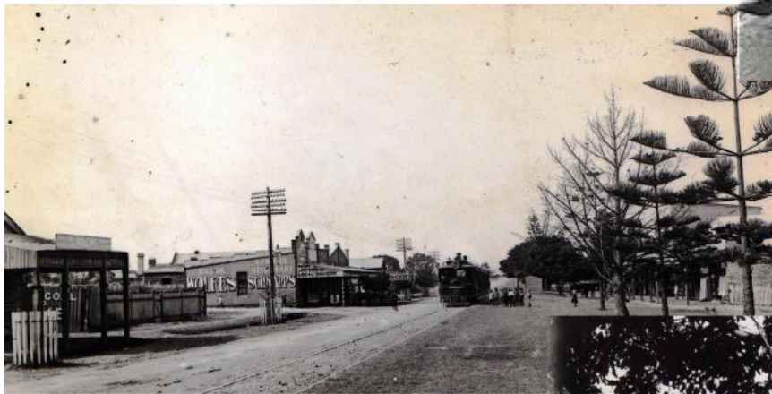
Rocky Point Road, Sans Souci