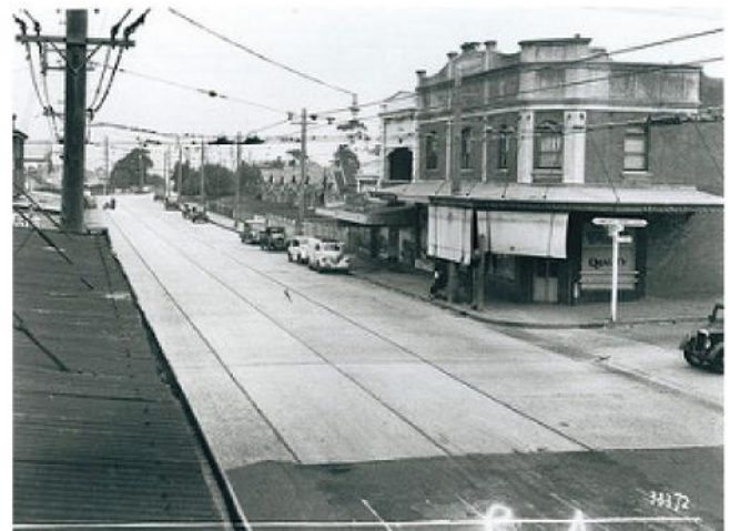
Ramsgate Shops on Rocky Point Road late 1930s ??