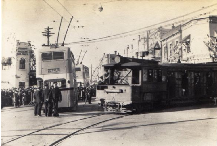
New trolley buses come to Rocky Point Road 1937