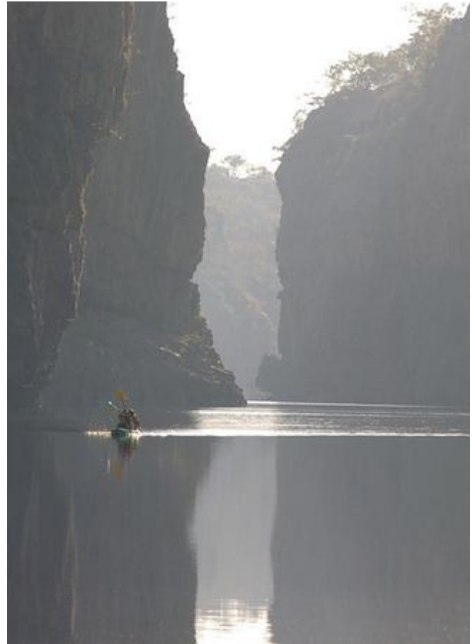
The stunning Katherine Gorge