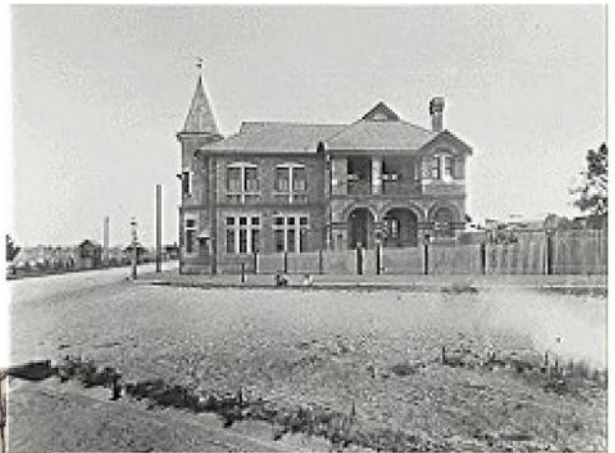
Kogarah Post Office