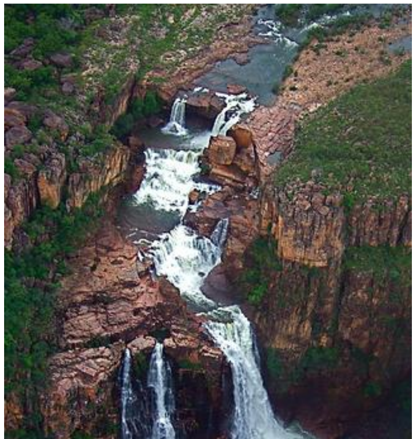
Kakadu National Park falls