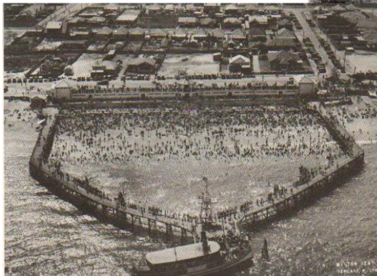
Brighton Baths circa 1930s