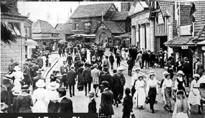
Sydney Royal Easter Show very early 1900s?