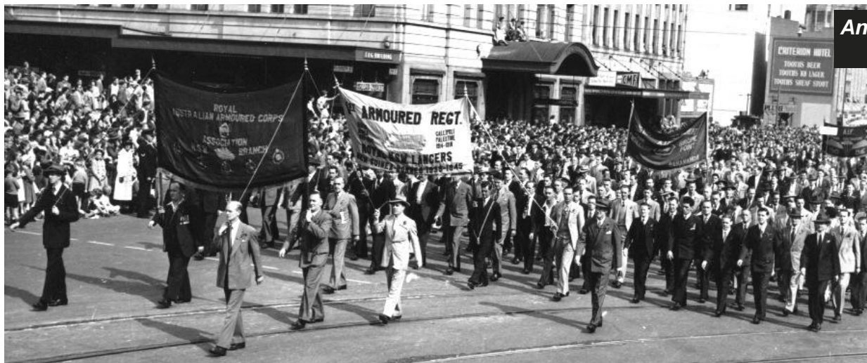
Anzac March 1951