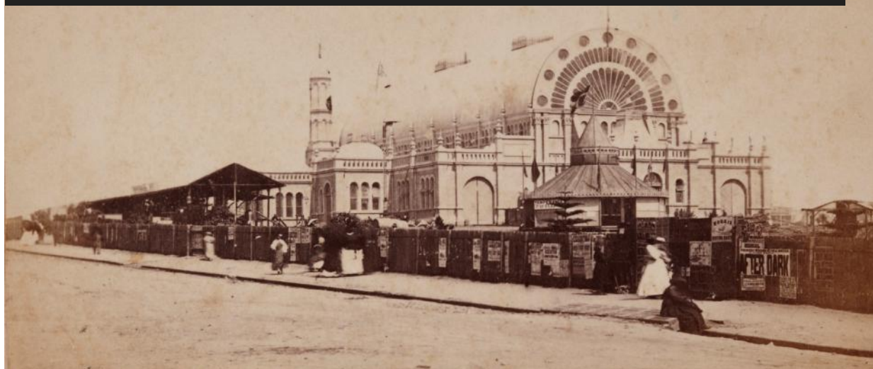
Exhibition Building, Prince Alfred Park, near Chalmers Street, Sydney, 1870