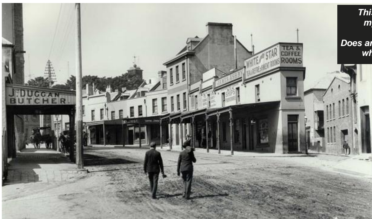
This one's a mystery? Does anybody know where it is