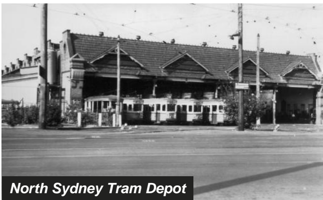
North Sydney Tram Depot