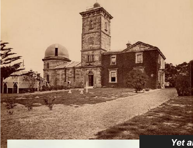
Sydney Observatory 1874